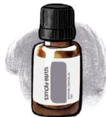
CLEAN & FRESH

Great for refreshing floors and wood surfaces.